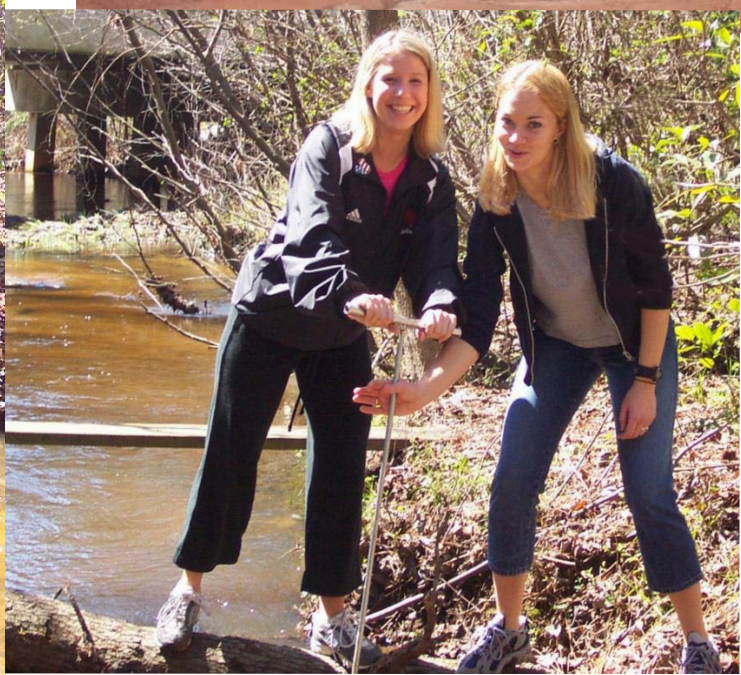
Hydrology is way cool !