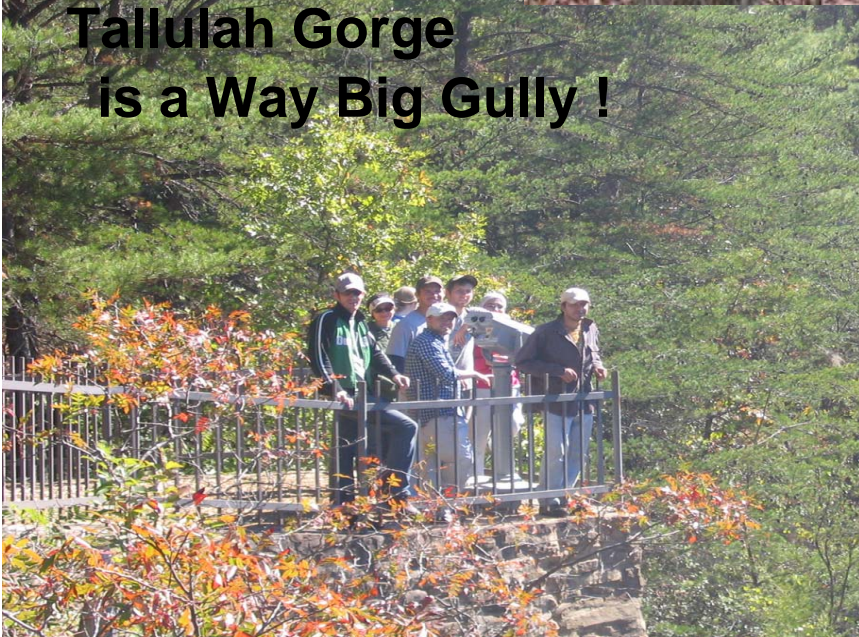
Tallulah Gorge is a Way Big Gully !