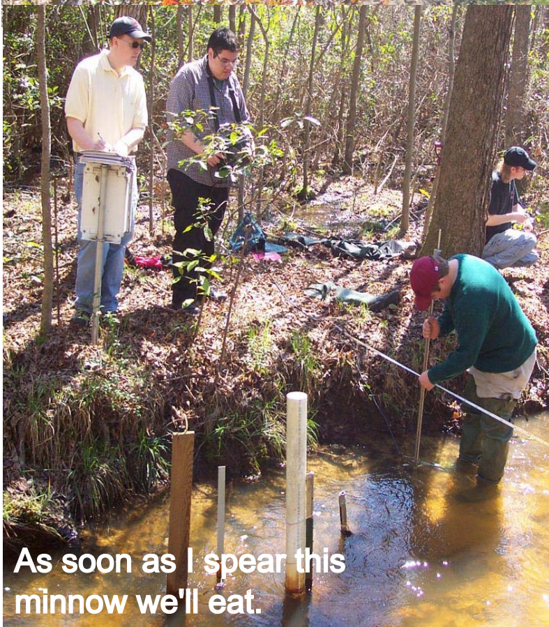
As soon as I spear this minnow we'll eat.